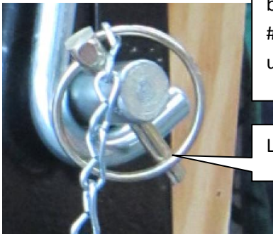
Lynch Pin fitted correctly

Note position of lifting hooks assembled on inside edges of "U" lifting lever N.B. Only ONE Lifting/Safety Pin is shown in these pictures for instruction picture clarity...Two Pins Must always be left in, and Lynch Pins must always be fitted when not adjusting height of trolley. # Never use only one PIN to try and exceed limits of use.